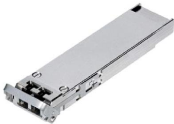
Figure 2. XFP Transceiver Module for the Cisco ONS Family

The XFP transceiver module (Figure 2) is a bidirectional device with a transmitter and receiver in the same physical package. The XFP module contains a 30-pin surface mount connector on the electrical interface and a duplex LC connector on the optical interface.