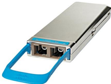
Figure 7. Cisco CPAK Module

Cisco CPAK 100GBASE fiber modules offer a selection of high-density 100-Gbps connectivity solutions. By using CMOS photonics technology, Cisco CPAK is smaller and consumes significantly less power than alternative form factors (Figure 7). They are fully interoperable with other IEEE-compliant interfaces.