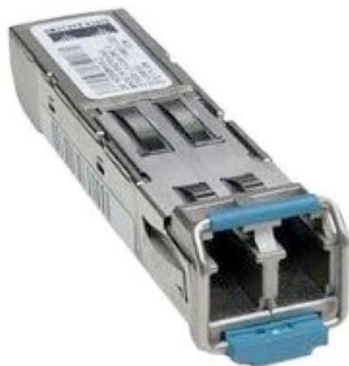
Figure 3. An SFP+ Transceiver Module for the Cisco ONS Family

An SFP+ transceiver module (Figure 3) is a bidirectional device with a transmitter and receiver in the same physical package. The module interfaces to the network through a connector interface on the electrical ports and through an LC termination connector on the optical ports. It is identical in size to SFP modules, but capable of 10-Gbps transmission.