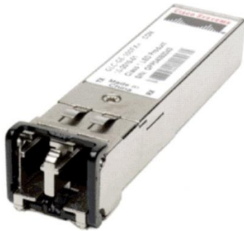
Figure 1. SFP Transceiver Modules for the Cisco ONS Family