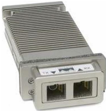
Figure 1. Cisco DWDM X2 Module

Main features of the Cisco DWDM X2 include: