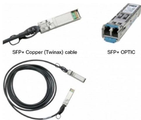
Figure 5. Cisco 10GBASE SFP+ Modules

The Cisco 10-Gbps Ethernet SFP+ (Figure 5) provides 10-Gbps Ethernet connectivity for the Cisco MDS 9500 10-Gbps 8-Port FCoE Module and MDS 9250i Multiservice Fabric Switch.