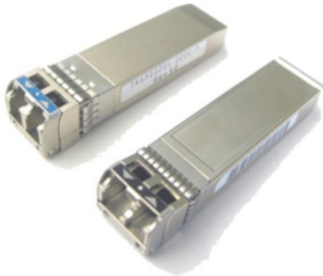
Figure 3. Cisco 8-Gbps Fibre Channel SFP+

The Cisco 8-Gbps Fibre Channel SFP+ (Figure 3) provides Fibre Channel connectivity for the 2/4/8-Gbps ports on the Cisco MDS 9000 Family platform. Three types are available: the Cisco Fibre Channel Shortwave SFP+ (part number DS-SFP-FC8G-SW) the Cisco Fibre Channel Longwave SFP+ (part number DS-SFP-FC8G-LW), and the Cisco Fibre Channel Extended Reach SFP+ (part number DS-SFP-FC8G-ER). Each offers 2/4/8-Gbps autosensing Fibre Channel connectivity.