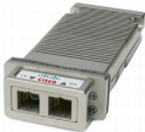
Figure 11. Cisco 10-Gbps Ethernet X2 Transceiver

The Cisco Ethernet X2 Transceiver Short Reach (up to 300m; part number DS-X2-E10G-SR) enables high-performance Fibre Channel connectivity for the Cisco MDS 9000 Family 10-Gbps Fibre Channel switching module to an existing Ethernet Dense Wavelength-Division Multiplexing (DWDM) transponder (Figure 11). The data format transmitted is identical to that transmitted by the Fibre Channel transceiver (DS-X2-FC10G-SR), except the Fibre Channel packets are clocked at the 10 gigabit Ethernet rate to carry Fibre Channel packets over a 10-Gbps Ethernet DWDM infrastructure. The Cisco MDS 9000 Family 10-Gbps Fibre Channel switching module will automatically detect DS-X2-E10G-SR; no software configuration is required.