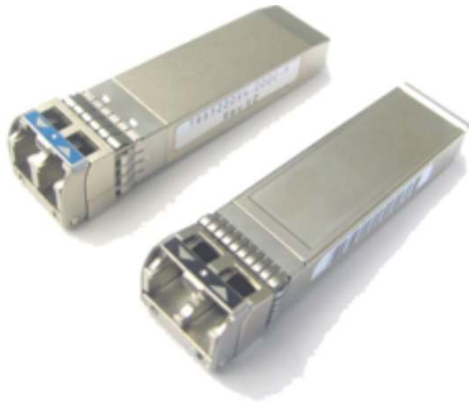
Figure 3. Cisco 8-Gbps Fibre Channel SFP+

The Cisco 8-Gbps Fibre Channel SFP+ (Figure 3) is designed to provide Fibre Channel connectivity for the 2/4/8-Gbps ports on the Cisco MDS 9000 Family platform. Three types of Cisco 8-Gbps Fibre Channel SFP+ are available: the Cisco Fibre Channel Shortwave SFP+ (part number DS-SFP-FC8G-SW) the Cisco Fibre Channel Longwave SFP+ (part number DS-SFP-FC8G-LW), and the Cisco Fibre Channel Extended Reach SFP+ (part number DS-SFP-FC8G-ER). Each product offers 2/4/8-Gbps autosensing Fibre Channel connectivity.