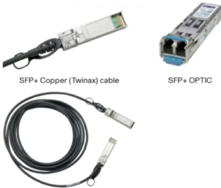
Figure 5. Cisco 10GBASE SFP+ Modules

The Cisco 10-Gbps Ethernet SFP+ (Figure 4) is designed to provide 10-Gbps Ethernet connectivity for the Cisco MDS 9500 10-Gbps 8-Port FCoE Module.