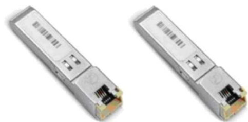
Figure 7. Cisco Copper Gigabit Ethernet SFP

To enable even more cabling flexibility, the Cisco MDS 9000 family offers a copper Gigabit Ethernet SFP. Based on the 1000BASE-T standard, the Cisco Copper Gigabit Ethernet SFP (Figure 5) provides cost-effective connectivity for data center applications. The Cisco Copper Gigabit Ethernet SFP (part number DS-SFP-GE-T) allows a user to use standard Category-5 unshielded twisted pair (UTP) cabling for Ethernet connectivity.