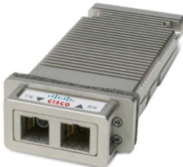
Figure 8. Cisco 10-Gbps Fibre Channel X2 Transceiver (Part Numbers DS-X2-FC10G-SR, DS-X2-FC10G-LR, and DS-X2-FC10G-ER)

The Cisco Fibre Channel X2 transceivers are designed to provide high-performance Fibre Channel connectivity for the 10-Gbps Fibre Channel ports on the Cisco MDS 9000 family platform. There are three types of Cisco 10-Gbps Fibre Channel X2 transceivers for transmission on optical cables: Cisco Short Reach (up to 300 m; part number DS-X2-FC10G-SR), Cisco Long Reach (up to 10 km; part number DS-X2-FC10G-LR), and Cisco Extended Reach (up to 40 km; part number DS-X2-FC10G-ER) (Figure 6). There is also a 10-Gbps Fibre Channel X2 transceiver for transmission on copper cable (up to 15 m; part number DS-X2-FC10G-CX4) (Figure 7). Each product offers 10-Gbps Fibre Channel connectivity.