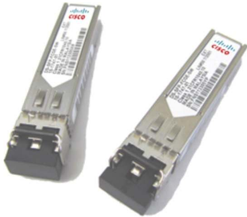
Figure 2. Cisco 4-Gbps Fibre Channel SFPs