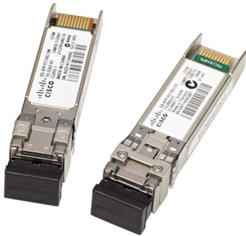
Figure 4. Cisco 10-Gbps Fibre Channel SFP+

The Cisco 10-Gbps Fibre Channel SFP+ (Figure 4) is designed to provide Fibre Channel connectivity for the 10-Gbps Fibre Channel ports on the Cisco MDS 9000 Family platform. Two types of Cisco 10-Gbps Fibre Channel SFP+ are available: the Cisco Fibre Channel Shortwave SFP+ (part number DS-SFP-FC10G-SW) and the Cisco Fibre Channel Longwave SFP+ (part number DS-SFP-FC10G-LW).