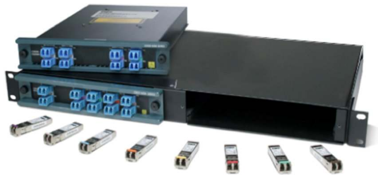
Figure 11. Cisco CWDM Extended Distance SFP Solution

The Cisco CWDM SFP solution enables the transport of up to eight channels over one pair of single-mode fiber strands, enabling enterprises to increase the bandwidth of an existing optical infrastructure without adding new fiber strands. The solution can be used in parallel with other Cisco SFP devices on the same platform.