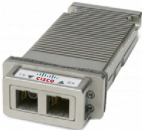
Figure 10. Cisco 10-Gbps Ethernet X2 Transceiver