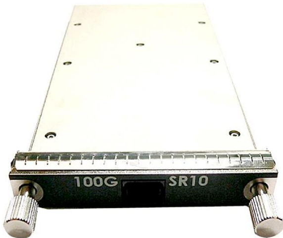
Figure 2. Cisco CFP-100G-SR10 Module