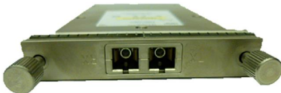
Figure 3. Cisco CFP-100G-ER4

The Cisco 100GBASE-ER4 (Figure 3) CFP module can support link lengths up to 40 kilometers on standard duplex single-mode fiber (SMF, G.652) terminated with SC/PC optical connectors. 100 Gigabit Ethernet signal is carried over four wavelengths. Multiplexing and demultiplexing of the four wavelengths are managed within the device. The Cisco 100GBASE-ER4 CFP module meets the IEEE 802.3ba requirements for 100GBASE-ER4 performance and also supports Digital Optical Monitoring (DOM) of the transmit-and-receive optical signal levels.